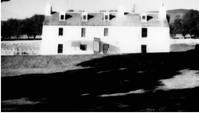
Easter Shian in an overhaul after being neglected 20 years or so in the 1950-the 1970s it was bought by the Tester Family and they converted vintage cars in the barns plus renovated the inside of the house adding the top floor conversion. The family stayed here for over 28 years.